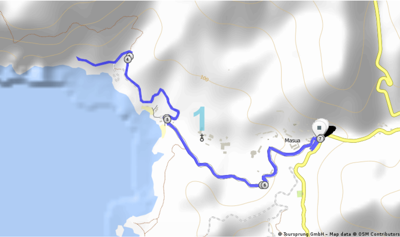
Map 1 / 1